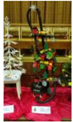
Wesley Cleaning Gang