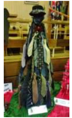
Wesley Mens Group