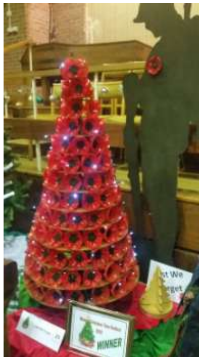
THE WINNING TREE

The Best Christmas Tree competition this year was won by the 5 th West Bromwich Boys' Brigade Company Section with their tree entitled "Lest We Forget" , which commemorated the centenary of the end of the First World War.