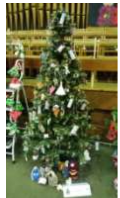
Wesley Sunday School