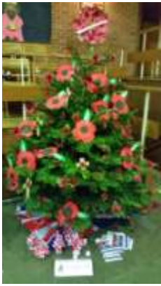
5 th West Bromwich Anchor Boys