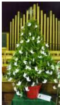
Memory Tree "Voice of Hope Choir"