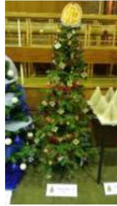
1 st West Bromwich Brownies