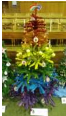
4 th West Bromwich Rainbows