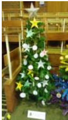
CAC Royal Priesthood