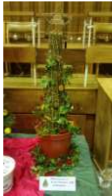
5th West Bromwich Junior Section