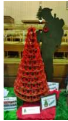
5 th West Bromwich Company Section