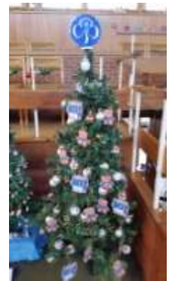
Wesley Guides & Centre Senior Section