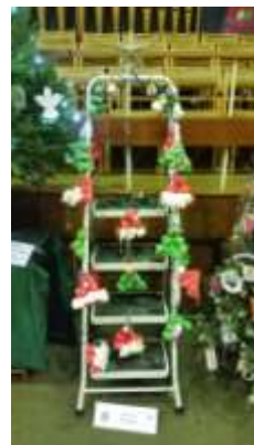
4 th West Bromwich Brownies