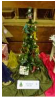
Let's Dance for Life