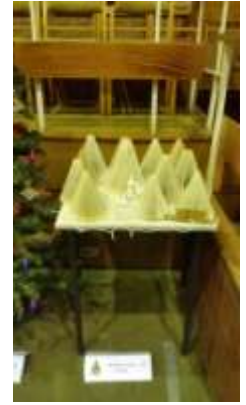
Knit & Natter